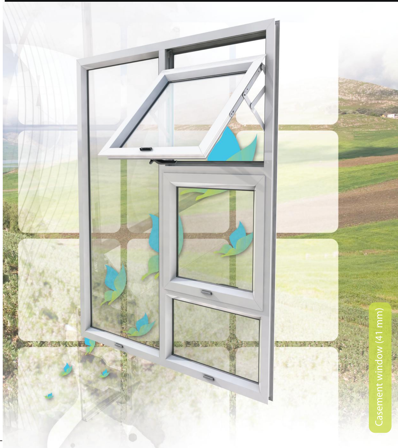
Casement window (41 mm)

This brochure must be read in conjunction with the Installation, Cleaning & Maintenance Guidelines and Performance Certificates for the relevant system. The Manuals must also be used in conjunction with the design and cutting lists from the latest version of Starfront.